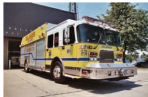
Rescue 74 carries the majority of the TRT's equipment