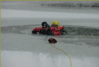
Ice Rescue Operations

The Northern Kentucky Technical Rescue Team is committed to providing quality technical rescue services to requesting agencies. The team personnel consist of a dedicated group of professionals committed to increasing knowledge and skills in the technical rescue field.